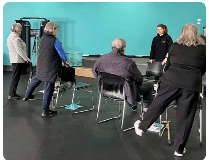
Falls Prevention Program Devonport

The program runs for six weeks, with weekly group classes tailored to each person's ability. Participants also receive a weekly phone call from a health coach, who helps set personal goals and provides support. At the end of the program, simple tests show how much each person has improved in strength and movement.